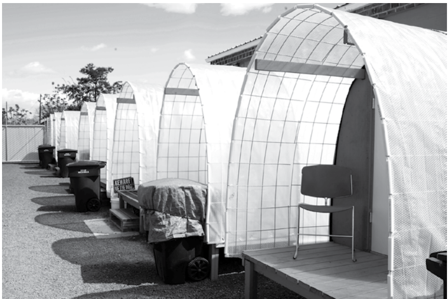
Walla Walla's Conestoga Huts.

The village has 29 tiny houses for single adults and couples without children. The tiny houses are each 8’ x 12’, insulated, have electricity and heat, windows, and a lockable door. There is also a security house, a communal kitchen, meeting space, bathrooms, showers, laundry, a case management office, and 24/7 staff providing security and management. Residents