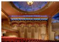
Building for the Arts