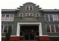
Building Communities Fund