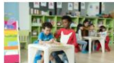
Early Learning Facilities Program