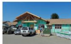
Behavioral Health Facilities

https://www.commerce.wa.gov/building-infrastructure/capital-facilities/