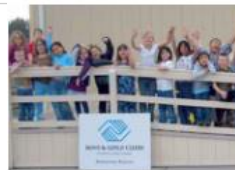
Youth Recreational Facilities