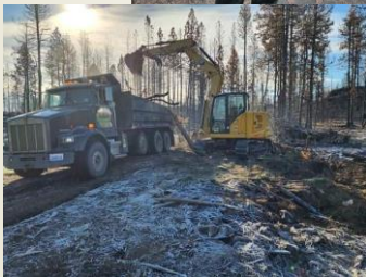
Photo of Community Organized Tree Removal Efforts