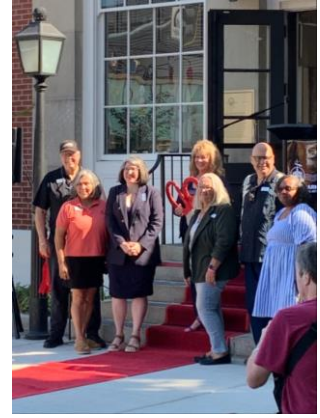
City of Auburn: Postmark Center for the Performing Arts