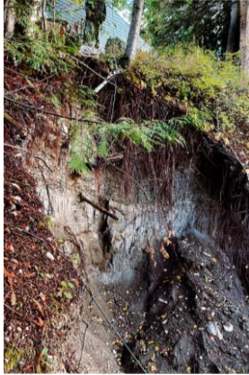
Town of Metaline Falls: Emergency Lift Station project

A few projects that can illustrate what success looks like