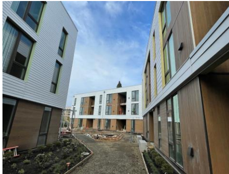
City of Vancouver: The Meridian project