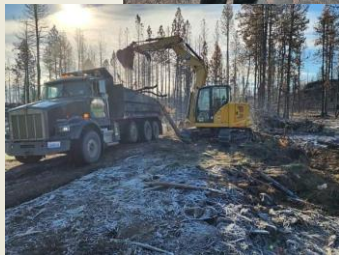
Photo of Community Organized Tree Removal Efforts